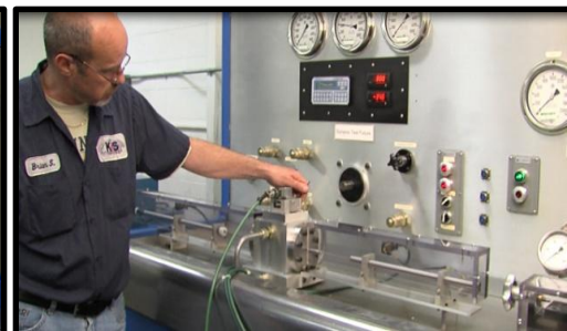
Dynamic Servo Testing