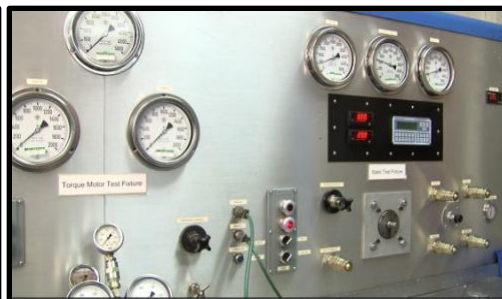
Torque Motor & Static Servo Testing