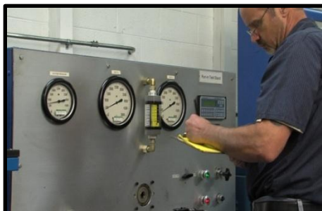
Dedicated Run – In Stand

Our Servo Valve Repair Lab has the capability to provide computer controlled dynamic and static testing. Our state of the art computerized load stands ensure that each valve meets OEM specifications.