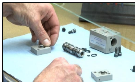
Clean Air Assembly Benches