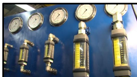
Closed Loop Testing