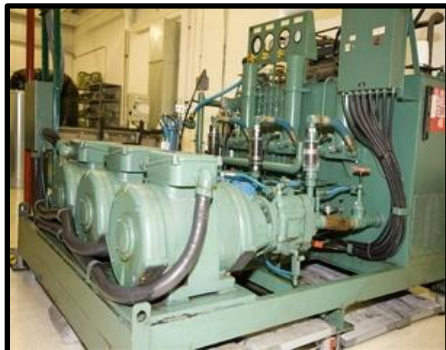
Hydraulic Power Units