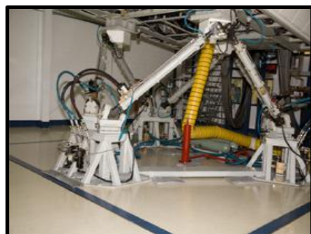
Hydraulic Motion Legs