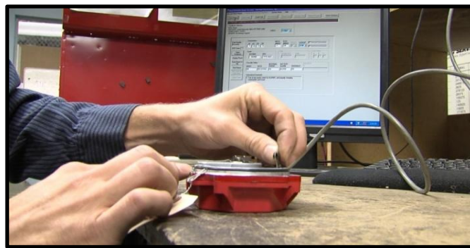
Complete Testing of Feedback Components