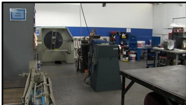
Motor Rewind Department